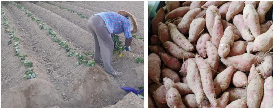
Figure 2 High ridge trials of sweet potatoes at Fanshu Xiaopu Family Farm, Qujiang District, Quzhou City (Left: High-Ridge Cultivation; Right: Commercial Tubers)

Based on the aforementioned literature, our farm implemented large-scale high-ridge sweet potato cultivation technology demonstration in 2015. The fresh tuber yield increased by 30% compared to low-ridge cultivation, with a 10% improvement in tuber marketability, resulting in significantly enhanced economic benefits (Figure 2).